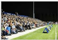
A Full House At the URI Soccer Camp