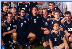
2006 A10 CHAMPS